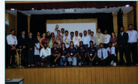
Quiz Competition 2025 Winners – Celebrating Sharp Minds and Quick Thinking