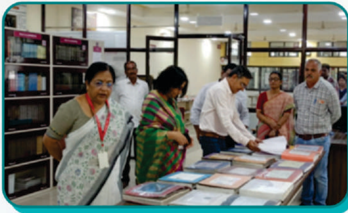
Exhibition of Library Books A curated showcase of knowledge and creativity