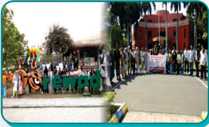
One Day Study Tour to Gorewada National Park & Raman Science Centre, Nagpur organized by Enviro- Club