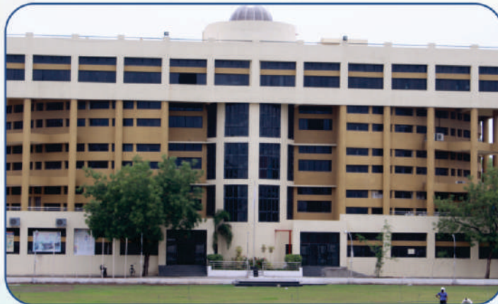
Wing : Self Finance Programmes