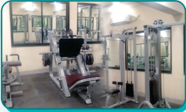
Gymnasium of V. B. S. M.