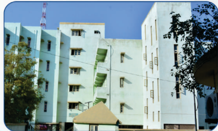
Pratibha Women's Hostel