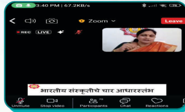
NEP 2020 Orientation & Sensitization Programme under UGC's Malaviya Mission Teacher Training Programme (MM-TTP)