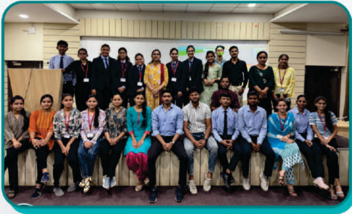
Soft Skill Development Workshop Movie Mania Activity