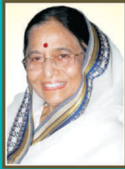
Hon'ble Smt. Pratibhatai Patil

First Lady President of India Former President Vidya Bharati Shaikshanik Mandal, Amravati.