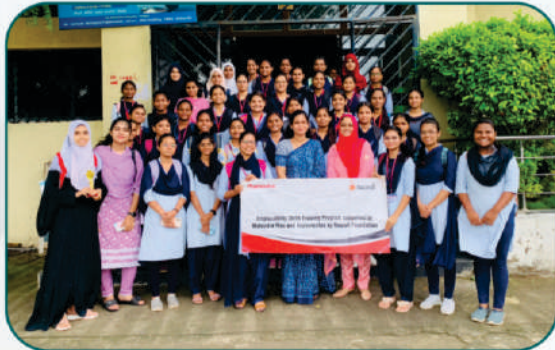
One-Week Employability Skills Training Program for girls by Mahindra Rise, Implemented by Nandi Foundation

Three B.Tech. Cosmetology students have been selected for an online internship program with Hilltop, Tokyo, Japan.