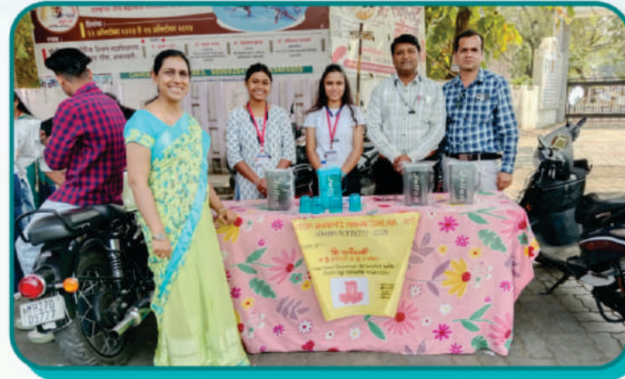
Entrepreneurship Activity: UDHYAM Explore Your Business Fundamentals