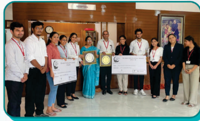
Hair care Team won "I" Prize Position with a cash prize of 50 K & Skin Care Team Won "II" Prize Position with a cash prize of 30 K in A State Level Competition held at Vimal Life Science Ltd. NESCO Goregaon, Mumbai.