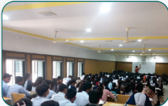
One-Month Certificate Course in Aptitude and Soft Skill Training Organized by the Training and Placement Cell, for equipping participants with vital skills for success