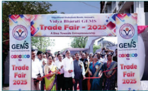
A Vibrant Trade Fair Experience to enhance entrepreneurial skills