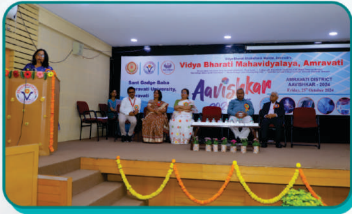
Inauguration of AVISHKAR – Amravati Division, SGBAU: Showcasing Innovation, Research & Creativity