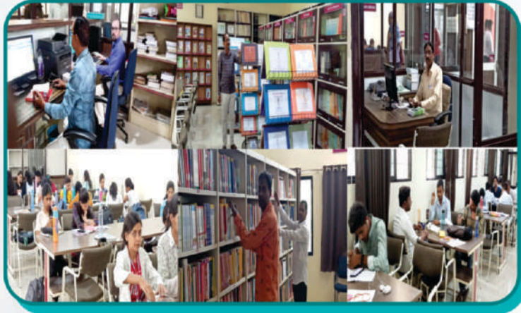
Library, Reading Hall & Browsing Centre