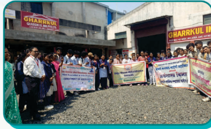
Industrial Visit to Gharkul Masale in MIDC Amravati The heart of local agro-processing, packaging, and rural entrepreneurship.