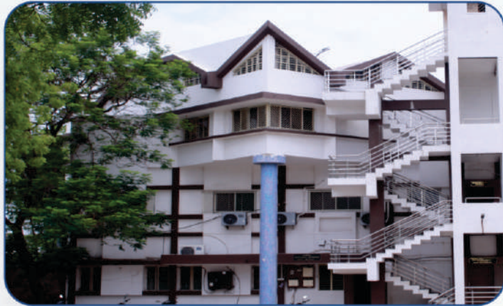
Head Office : Vidya Bharati Shaikshanik Mandal, Amravati