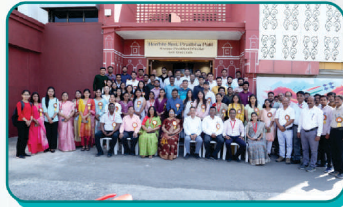
Alumni Meet 2024-25 A heartwarming gathering of past and present, as our eminent alumni reconnect to share their experiences, memories, and valuable insights with the next generation of students