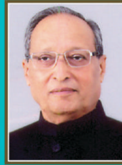
Late Hon'ble Dr. D. R. Shekhawat

First Lady President of India Former President Vidya Bharati Shaikshanik Mandal, Amravati.