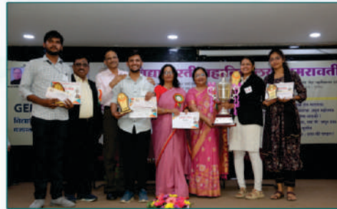
Winners of State Level Elocution Competition 2025 proudly display their trophies & certificates alongside esteemed dignitaries