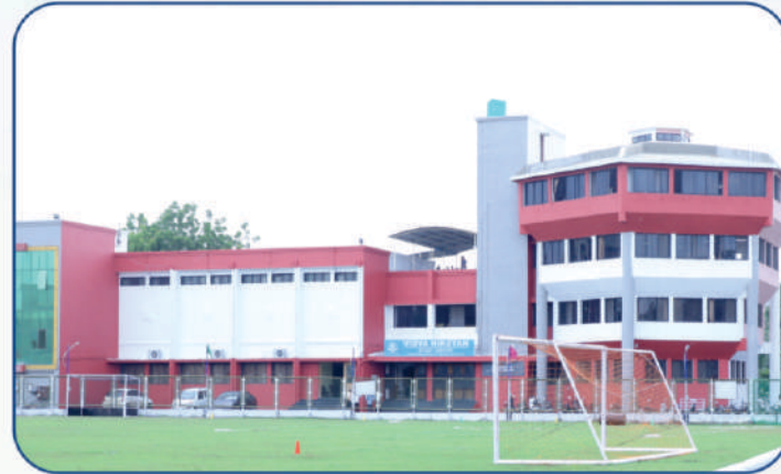
Yoga Hall, Sports Complex & Vidya Niketan Study Centre